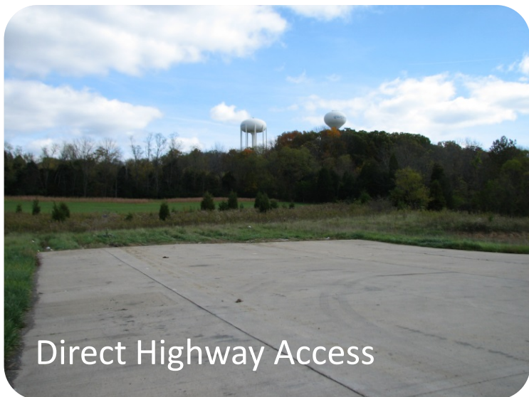
Direct Highway Access