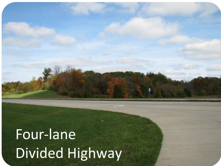
Four-lane Divided Highway