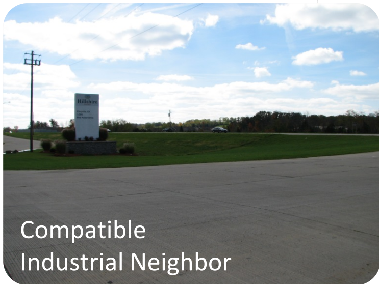
Compatible Industrial Neighbor