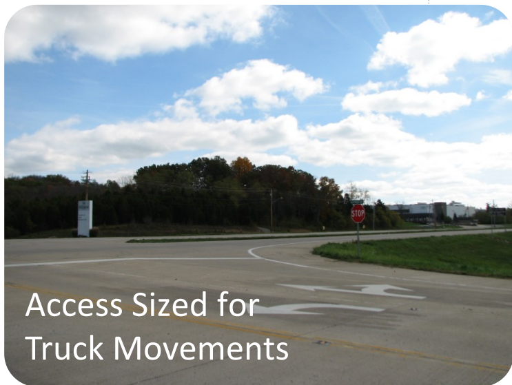
Access Sized for Truck Movements