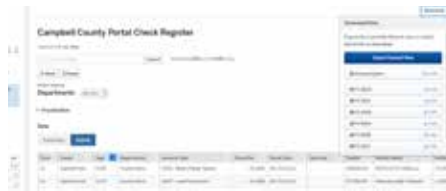
Sample query of the check register. This data can also be downloaded.

If you need assistance navigating OpenGov, please contact the Finance Department for assistance.