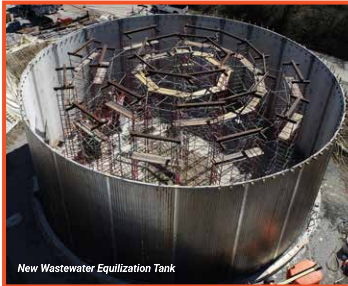
New Wastewater Equalization Tank

The next time you wonder why your SD1 bill is higher than your water bill, remember the unique challenges that come with collecting, transporting and treating the millions of gallons of Northern Kentucky wastewater every day. SD1 does all of that for about 2 cents per gallon.